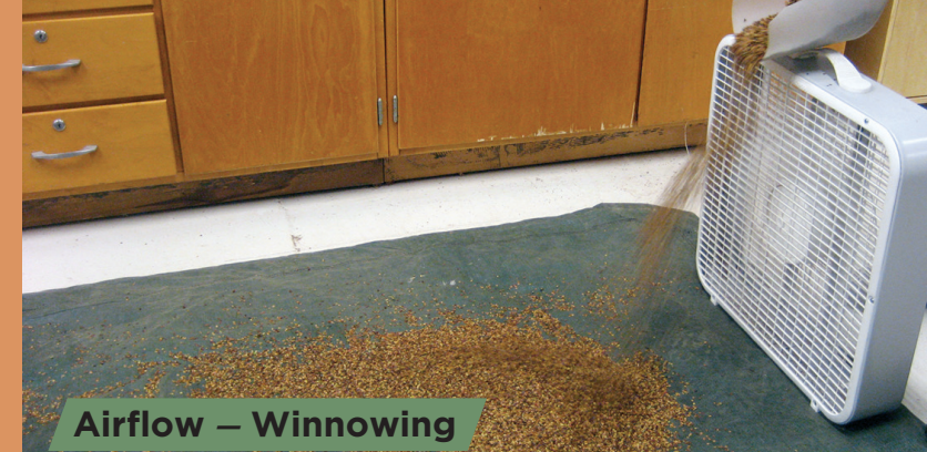
Airflow — Winnowing

This series of screening processes is effective in concentrating desired seed and removing most inert material. Not all seeds will be viable, however, even if they otherwise look normal. Some seeds will be 'light' in weight due to immaturity, underdevelopment or from being eaten from the inside by seed predators. These seeds will not be removed by simple screening. This "light" seed is removed with airflow, either by winnowing or aspiration.