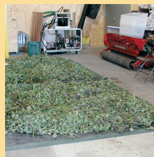
Spiderwort spread on tarp with box fan.

Larger quantities can be spread on tarps and turned once or twice daily with pitchforks. Place box fans strategically to keep air circulating over and around bulk material. Do NOT use any form of direct heat! It can damage and kill seeds. Drying may take several days to two weeks, depending on quantity and drying conditions.