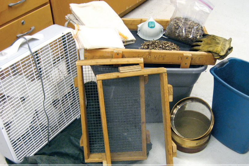
Much of the bulk material in native seed collecting is non-seed (inert) floral parts, leaves, and stems. The quantity of material collected will dictate the scale of time, tools, and equipment needed for efficient drying and processing of the seed. Some species are more challenging to process than others.