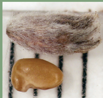
Purple prairie clover with hull, top; dehulled below.

Many grass species have seeds with “beards” (hair-like awns), and many forb species have “parachutes” (pappus) attached to seeds (e.g. fluffy seed of asters and goldenrods). These awns and pappus are adaptive and aid seed dispersal in nature. Debearding is the process of removing these hair-like appendages. The terms debearding and deawning are sometimes used interchangeably and applied to both grass and forb seed.