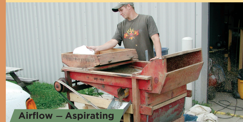
Airflow — Aspirating

Winnowing uses horizontally moving air to separate heavy from light particles. Winnowing seed in a gentle breeze can be very effective in removing chaff and light seed. To achieve more control, place a tarp on the floor and an ordinary box fan at one end of the tarp. Pour seed gently in front of the fan. Heavier seed falls closer to the fan than light seed or empty seed. Fine-tune the process by experimenting with fan speed and distance from the fan. Once you find the most effective combination, continue to pour the seed in front of the fan in a consistent manner. The seed should now be laying somewhat fanned out on the tarp, with the heavier seed nearer to the fan and light or empty seed further away. Using a thumbnail, push down on the seed coats closest to the fan at first, repeating this test as you gradually move away from the fan. Heavy seed will feel firm and resist being crushed with gentle, downward pressure; empty seeds, on the other hand, will offer little resistance and crush easily. Make a determination where the heavy seed ends and the light or empty seed begins, and draw a line through the pile of seed at this point. Clean, heavy seed can then be swept up and stored for planting, while the rest is discarded.