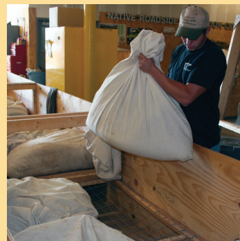
Breathable cotton bags full of seed heads in forced-air-drying bins.

Drying bulk material immediately after harvest is critical for preventing mold and mildew. Drying will also allow some immature seeds to ripen and aid threshing of the seed out of seed heads or pods, and thus help maximize seed yield. Small amounts can be placed loosely in cloth or paper bags or spread out on screening or newspaper in a cool, dry place with good air circulation. If using paper bags, leave tops open and turn the contents once or twice daily. Take care not to pack collected bulk material into bags too tightly; keep it loose so air can circulate.