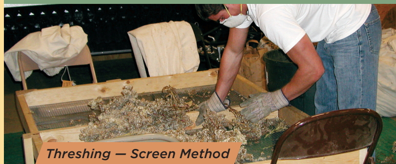
Threshing — Screen Method

Many species have seeds that shake free of a capsule or open pod. This method can be effective for dried seedheads of Culver's root ( Veronicastrum ), cardinal flower and great blue lobelia ( Lobelia ), shootingstars ( Dodecatheon ), mints ( Pycnanthemum , Monarda ), and gentians ( Gentiana ). Either hold dry seed heads upside down against the inside of a tub or place in a bag and shake or beat gently to free seed. This method has the advantage of minimizing the amount of chaff and inert material in the seed.