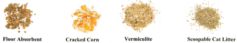
Different types of filler material that can be mixed with prairie seed to increase its bulk and improve flow through a grass drill.

Barnhart, S. 2002. Improving pasture by frost seeding . Iowa State University Extension Bulletin. PM-856. Iowa State University, Ames, Iowa.