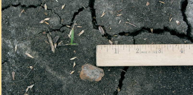
Seeds on cracked soil. Prairie seeds can become incorporated into the soil by the cracks that are created by freeze-thaw cycles in late winter.

Planting mid- and late-summer is risky business. Newly germinated seedlings exposed to excessive heat and drought will perish. In addition, many prairie species require 2-6 weeks to germinate. By the end of the growing season, it is likely that seedlings may be too small to survive the winter. Seeding natives during this time is not recommended.