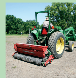
Seeding natives with a Brillion grass seeder. Seed is dropped in between two steel wheel gangs - one conditions the soil and the other cultipacks the seed.