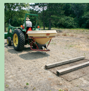
Broadcast seeding with a Viacon fertilizer spreader and dragging a piece of fencing to incorporate the seed into the soil.

To assure that the seed is evenly distributed over the planting site, the seed must be properly mixed and the seeding rate carefully calculated. The seed should be mixed in equal parts with inert material such as vermiculite, cracked corn, or kitty litter. This will increase the volume of the seed. Because of improvements in seed cleaning, the volume of prairie seed needed to plant a smaller site (1 acre (.04 hectare) or less) may not fill a 5-gallon bucket. Mixing any of these materials with the prairie seed will improve the seed flow through the seeder, and will make calculating the seeding rate much easier. Seed can be mixed in a plastic tub by hand or on a concrete slab using a flat shovel. If you use a mechanical seeder, calibrate the equipment before sowing seed and follow the calibration procedure as listed in the owner's manual. If seed is hand broadcasted, divide seed by half and sow each half over the entire site so the site is seeded twice. This will ensure even seed dispersal and distribution over the site. After seeding, seed should be incorporated into the soil to improve seed-to-soil contact. Incorporating seed into the soil can be done by dragging a piece of heavy chain, or a piece of chain link fencing, or using a drag harrow, or raking seed in with a garden rake. Drag, harrow, or rake until the seed disappears. Finally, pack the soil with a cultipacker or lawn roller.