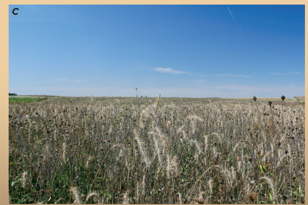
Seasonal Changes in a 5-year-old prairie planting. Photos were taken the same year in (A) late spring, (B) mid-summer and (C) early fall.