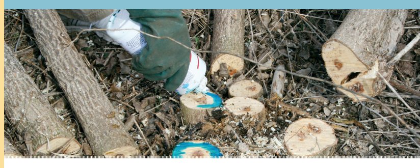
Stump treatment of cambium with Tordon

9. Cut rather than foliar spray woody plants. Many brush herbicides require complete coverage when foliar sprayed. There is the potential for excessive over-spraying onto non-target plants. A cut-stump herbicide to prevent the stump from resprouting can be applied precisely to where it is needed without damaging surrounding vegetation (Table 1).