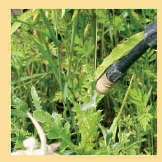
Closeup of backpack sprayer with wand extension spraying Canada thistle.