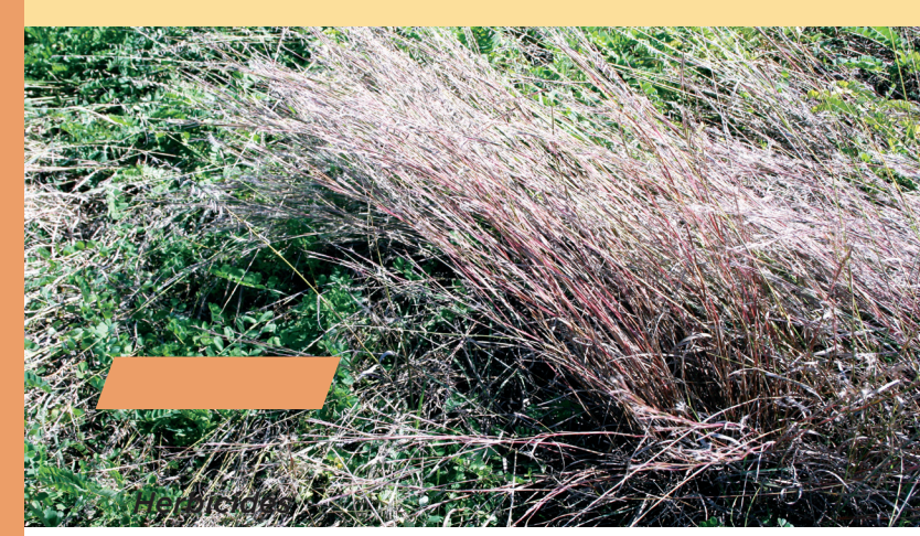
Figure 1. Crown vetch (green) can be sprayed in fall when adjacent prairie vegetation is dormant.

Mowing is only partially effective at controlling persistent perennial weeds and woody plants. It will eliminate seed production and reduce weed canopy if implemented at the right time during the growing season but will have little effect or in some cases increase rhizomal spread (Lalonde et al. 1994). In those circumstances, herbicides may be needed to control persistent perennial weeds.